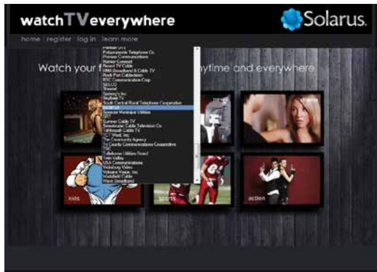
Select Provider Screen

At the “ log in ” page you will enter in the email address and the password you registered with. Click the “ log in ” tab to proceed.